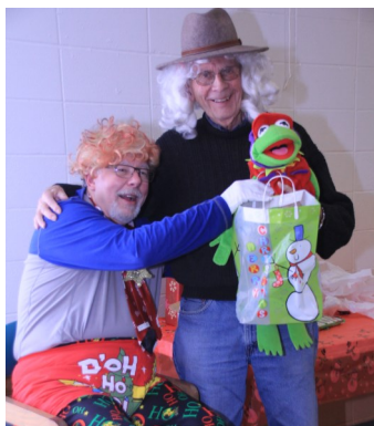
Christmas Party (2014)